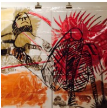
The Foster Gallery presents 'Volta'