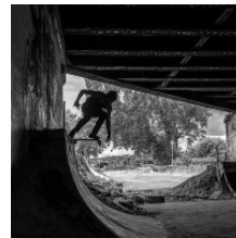
Worcide: Worcester DIY skatepark asks for city support